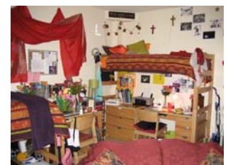
Resident Room (View 2)