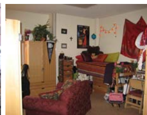
Resident Room (View 1)