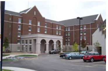
View from Bernard Circle