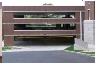
Four-Level Parking Garage