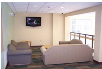
Second Floor Loft