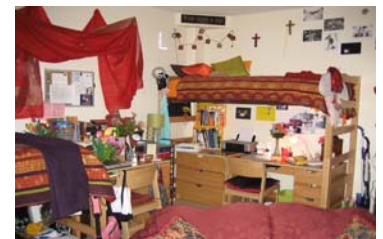
Resident Room (View 2)

Mailing Address: 1900 Belmont Blvd. Kennedy Hall [Room #] Nashville, TN 37212