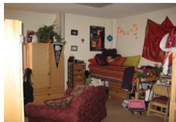
Resident Room (View 1)