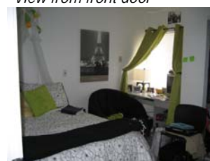
Resident room (View 1)