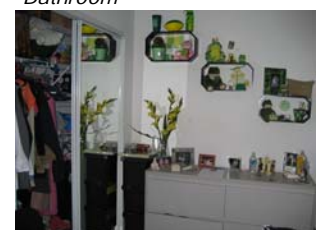
Resident Room (View 2)