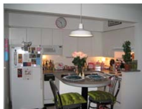
Kitchen Area (View 1)