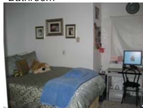
Resident Room (View 1)