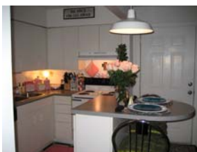
Kitchen Area (View 2)