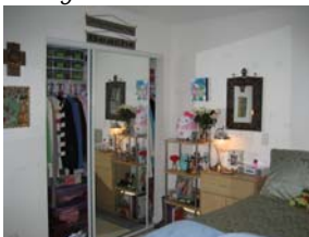
Resident Room (View 2)