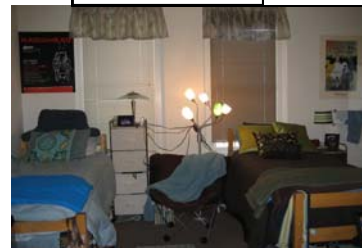
Resident Room (View 1)