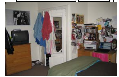
Resident Room (View 2)