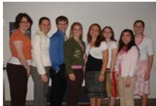
Alpha Chi inductees for Spring 2007