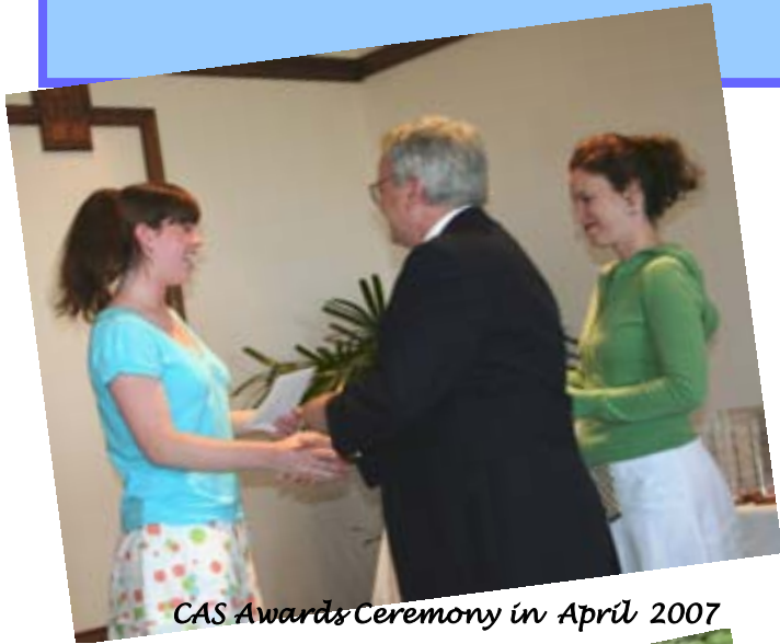
CAS Awards Ceremony in April 2007