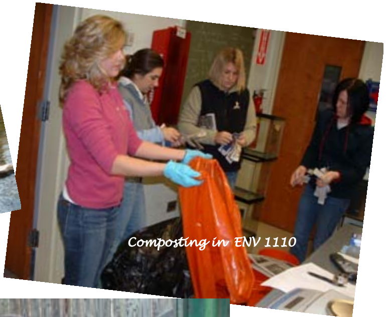
Composting in ENV 1110