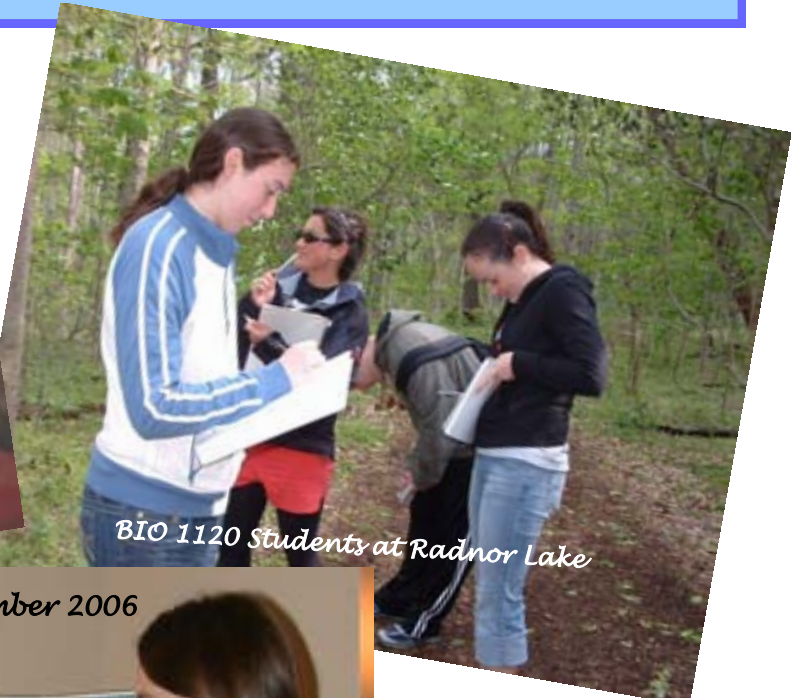
BIO 1120 Students at Radnor Lake