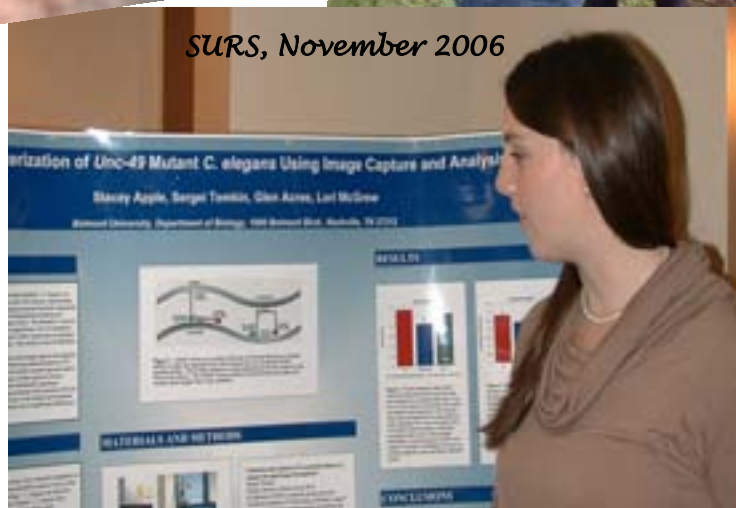
SURS, November 2006