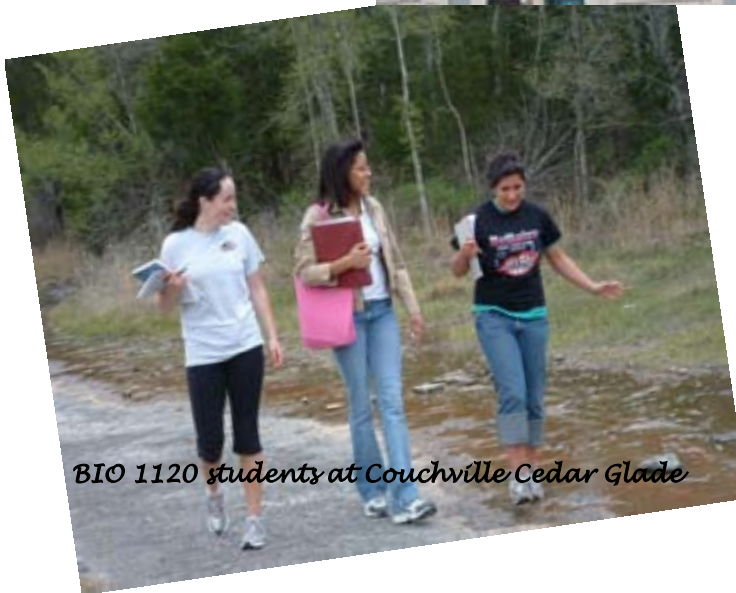
BIO 1120 students at Couchville Cedar Glade