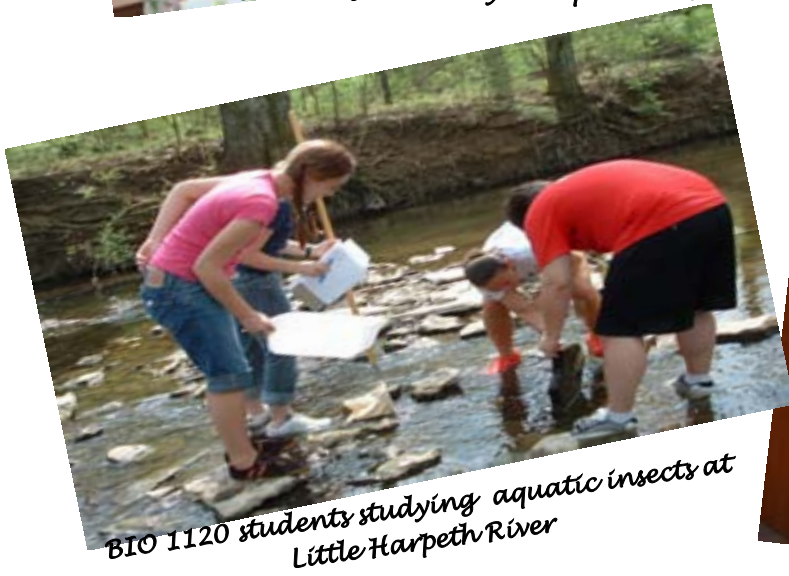
BIO 1120 students studying aquatic insects at Little Harpeth River