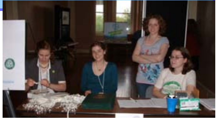
Environmental Sustainability conference, Belmont goes green