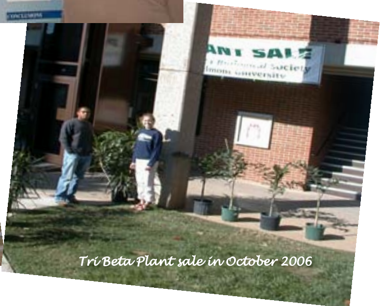
Tri Beta Plant sale in October 2006